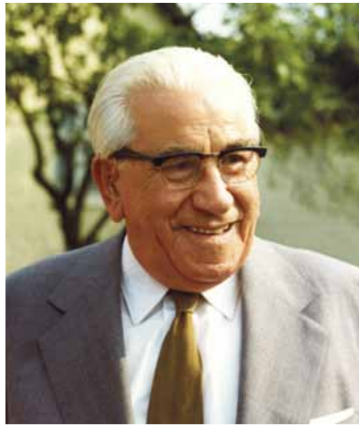
"My greatest desire is to use my knowledge to help people to love one another"